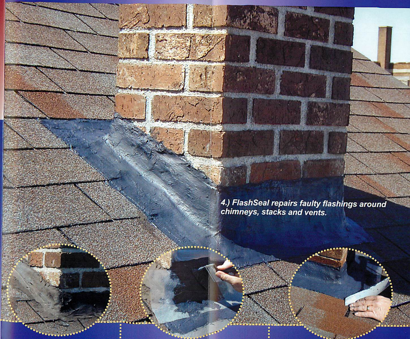
4.) FlashSeal repairs faulty flashings around chimneys, stacks and vents.

A professionally installed FlashSeal application is like installing a custom fit waterproof boot at the base of your chimney.